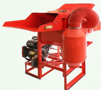
Paddy Thresor Model AA-300