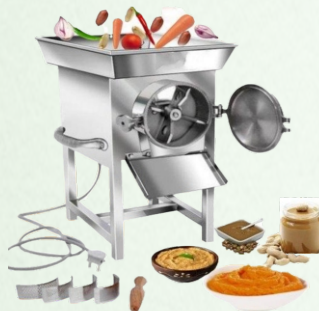
Gravy Machine Model AA-210