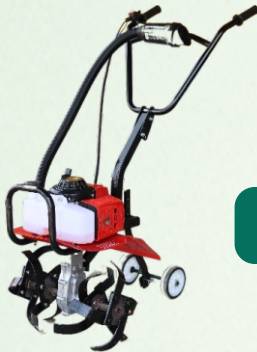
Mini Weeder Model AA-300