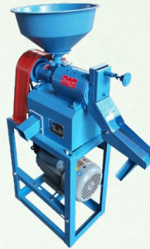
Rice Mill Model AA-220