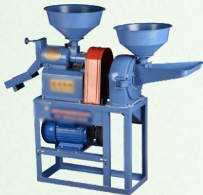
Combine Rice Mill Model AA-225