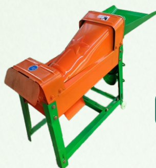
Corn Thresor Model AA-235